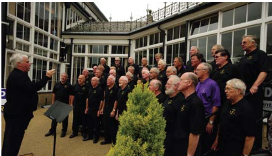
Tideswell Male Voice Choir at Buxton Festival Fringe.