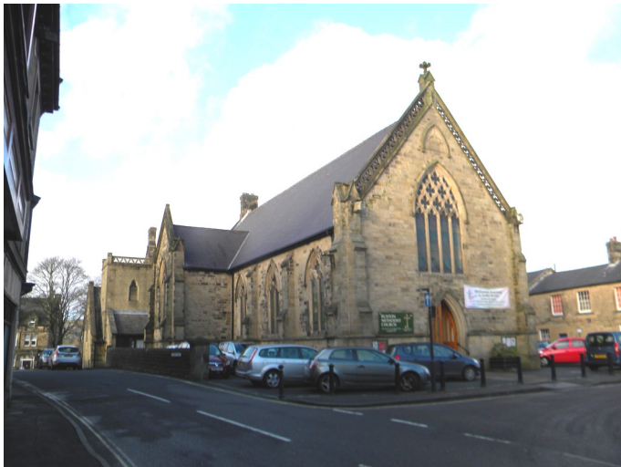
The Methodist Church on the Market Place

The Methodist Church features in the background of so many photographs of the Market Place, standing as it has, in such a prominent position since 1849. Recently it has been centre stage owing to a decision to install solar panels on its large and therefore highly suitable roof. Buxtonians will remember that it was modernised internally, as well as being re-roofed, thirty years ago. These improvements revitalised a building that is used by a hundred regular worshippers and also up to six hundred people from our community in a variety of ways each week.