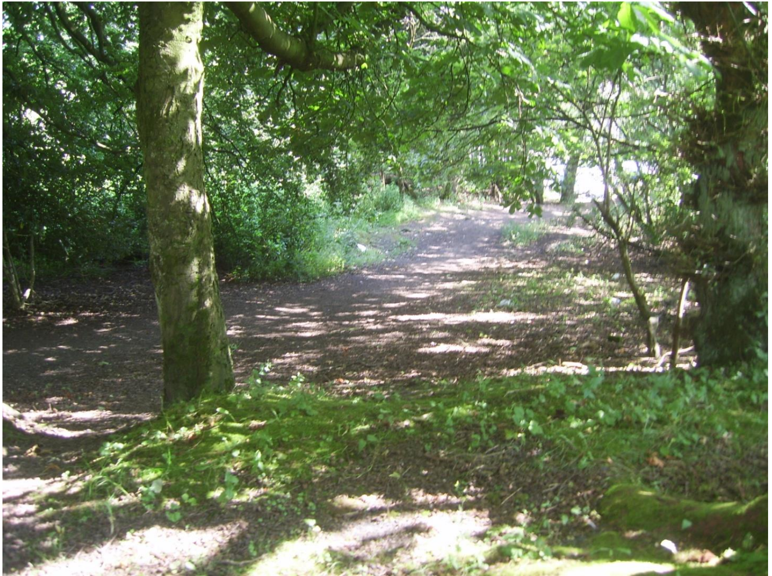
Palace hotel railway woods