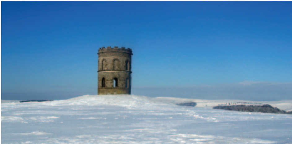
Solomon's Temple in the snow

Buxton is fortunate in its inheritance of historic buildings set in beautiful countryside. The price of keeping them is constant vigilance and our Civic Association is one of Buxton's 'watchdogs'. The aims of BCA are exemplified in its relationship with one of Buxton's high spots – Solomon's Temple.